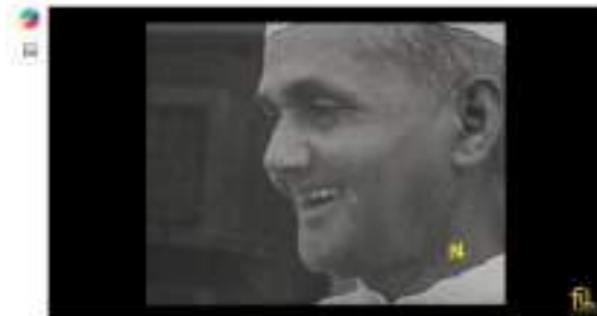
Homage to Lal Bahadur Shastri