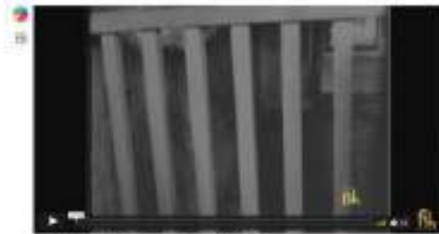
85 NAYAK NI POL PORBANDER